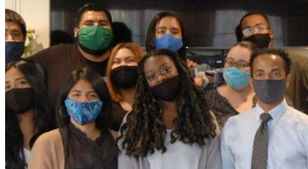
College students in West LA