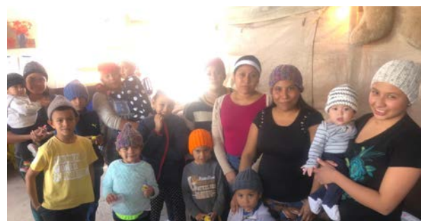
Refugee families at the border