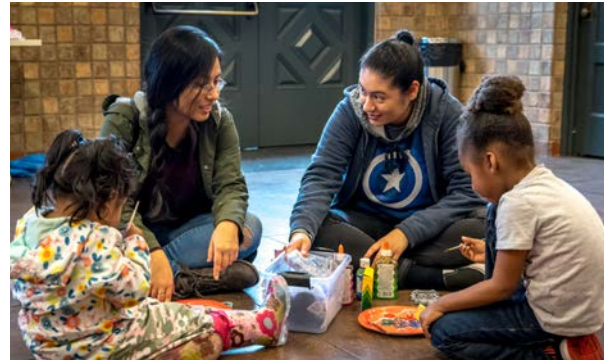
Support for teen moms