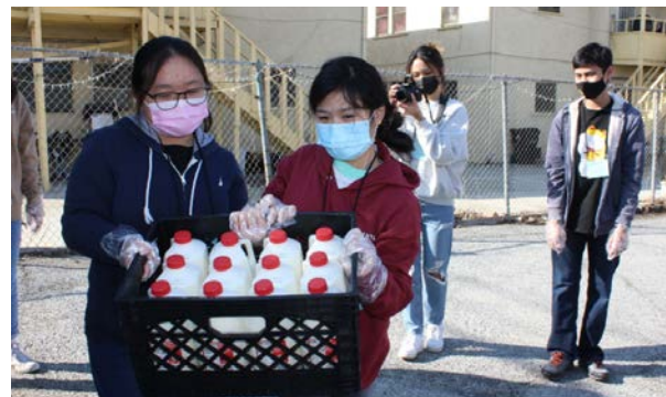
Groceries for families in East LA