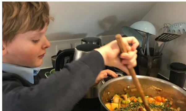
Weekly meals for families in the UK