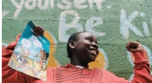
Virtual education support for students in Kenya