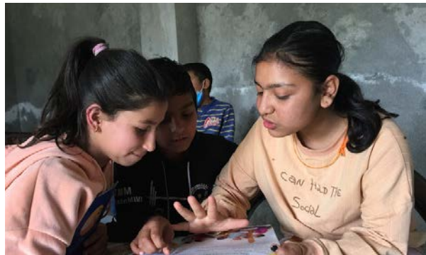
Peer support and education in Nepal