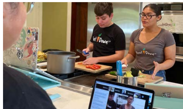
Virtual culinary training classes