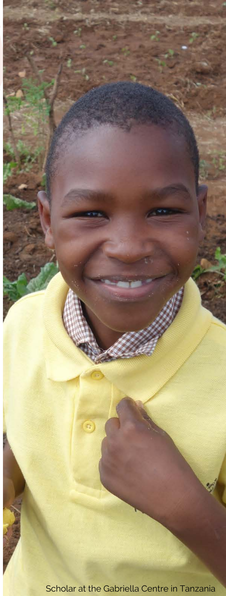
Scholar at the Gabriella Centre in Tanzania

LIVES CHANGED FUTURES TRANSFORMED YOUTH WITH HOPE CHILDREN GIVEN OPPORTUNITY